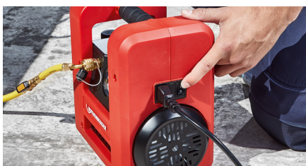
Removable cable and power button for convenient starting procedure