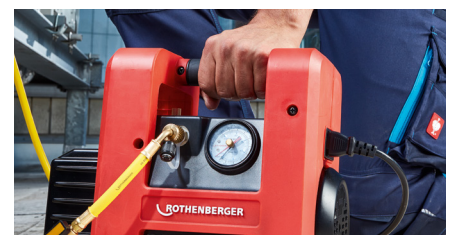
Ergonomic handle for easy transport