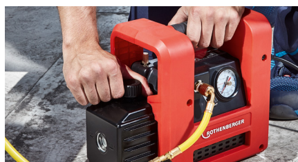
Special filter for reducing oil mist on exhaust vent