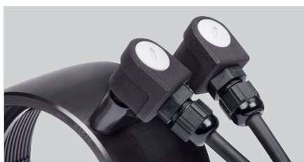
90° angled plugs