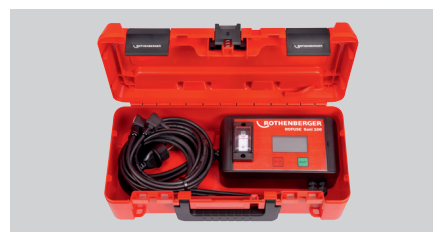
Robust packaging in RO CASE