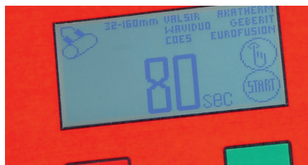
Large illuminated display