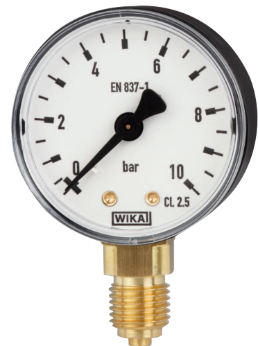
Bourdon tube pressure gauge model 111.10