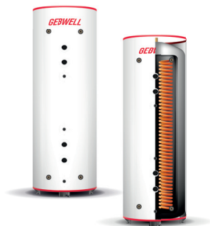
G-Energy Coil 501 2x25