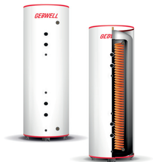
G-Energy Coil 501 1x25