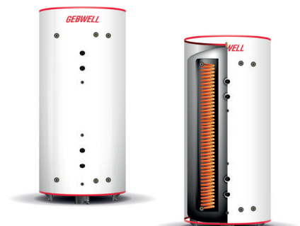
G-Energy Coil 1000 3x25