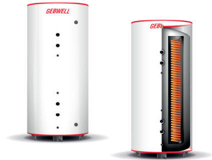
G-Energy Coil 1000 1x25