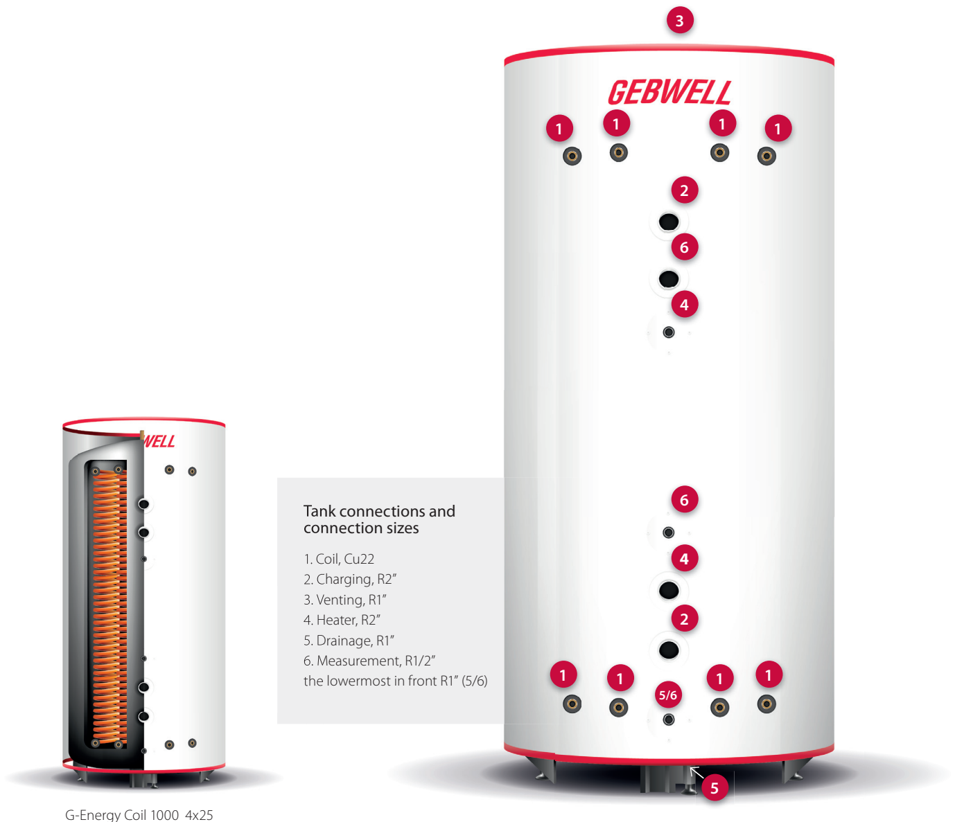
G-Energy Coil 1000 4x25