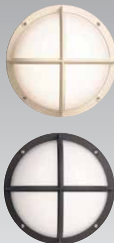
Neptune 001 with LED light source and sensor