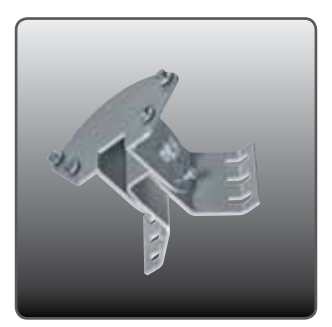
Adjustable wall/corner bracket

The fitting is prepared both for open and hidden installation. Push in terminal block 5x2x2,5 mm<sup>2</sup> with through-wiring possibilities.