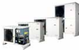
Optyma Plus Condensing Units