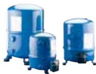
Maneurop Reciprocating Compressors