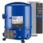
Maneurop Variable Speed reciprocating compressors