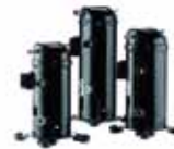
Performer Refrigeration scroll compressors