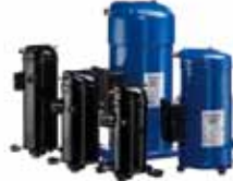
Performer Air Conditioning scroll compressors