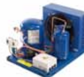
Optyma Condensing Units

Our products can be found in a variety of applications such as rooftops, chillers, residential air conditioners, heatpumps, coldrooms, supermarkets, milk tank cooling and industrial cooling processes.