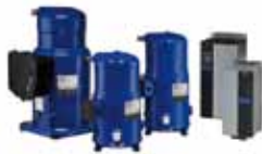
Performer Variable Speed scroll compressors

We have 40 years of experience within the development of hermetic compressors which has brought us amongst the global leaders in our business, and positioned us as distinct variable speed technology specialists. Today we operate from engineering and manufacturing facilities spread across three continents.