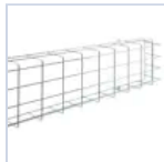
8063 BS100 GRIGLIA PROTEZ 36/58W