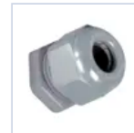
15018 KIT ATEX ACCIAIO ECO