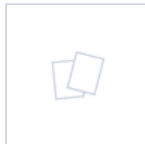
8063/1 GR STAFFA UNICA GRIGLIA 8063