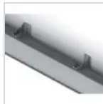
20122 STAFFA ORIENTABILE ACC E LED