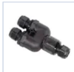
15019 RACCORDO DOPPIO INGRESSO M20