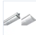
20113 SCHERMO ACC PROTEZ HCCP 1500