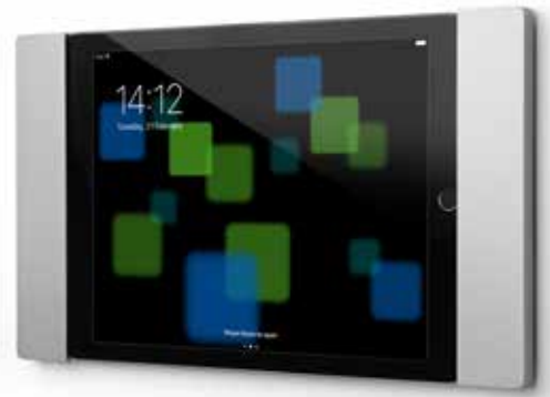
Illustration with iPad Air