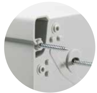
Multiple wall mounting options