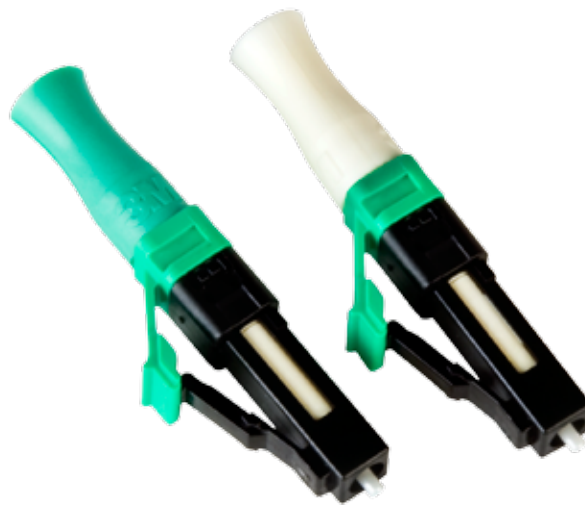
3M™ No Polish Connector LC/APC 250 μm/900 μm

NPC has a streamlined boot that is attached to the connector body, minimizing the chance of losing or forgetting to install the boot during the connection. After termination, the boot keeps the fiber from kinking, even during side pull.