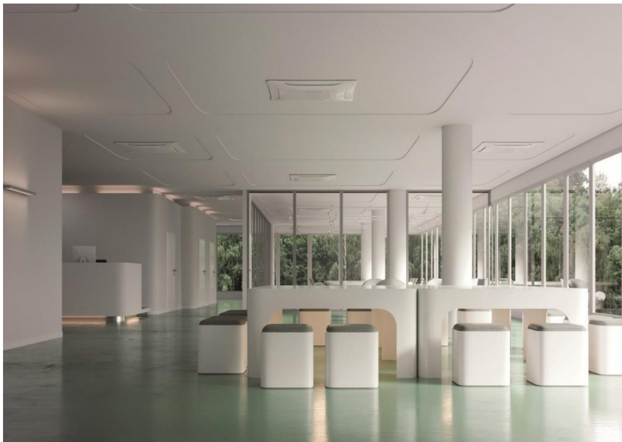
Picture of the installed SK-ECM Fan Coil