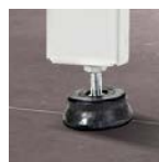
AV 740 Optional feet dampers