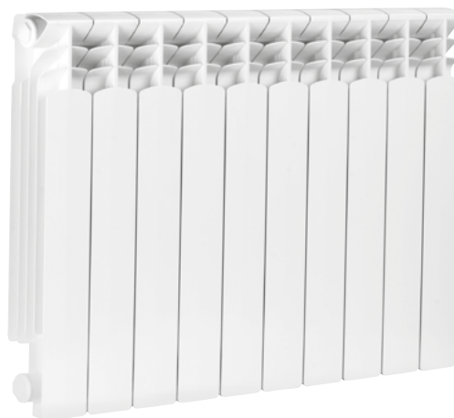
789-100-44 G500F ALUMINIUM RADIATOR