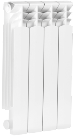
789-040-44 G500F ALUMINIUM RADIATOR