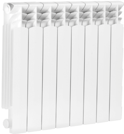
789-080-44 G500F ALUMINIUM RADIATOR