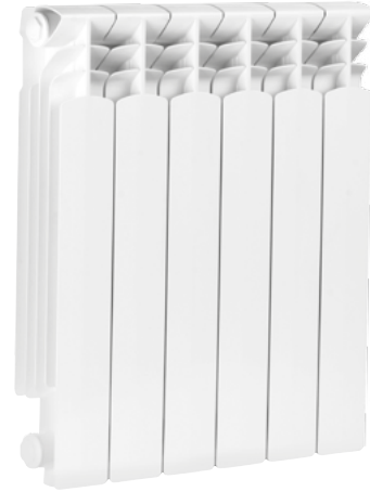
789-060-44 G500F ALUMINIUM RADIATOR